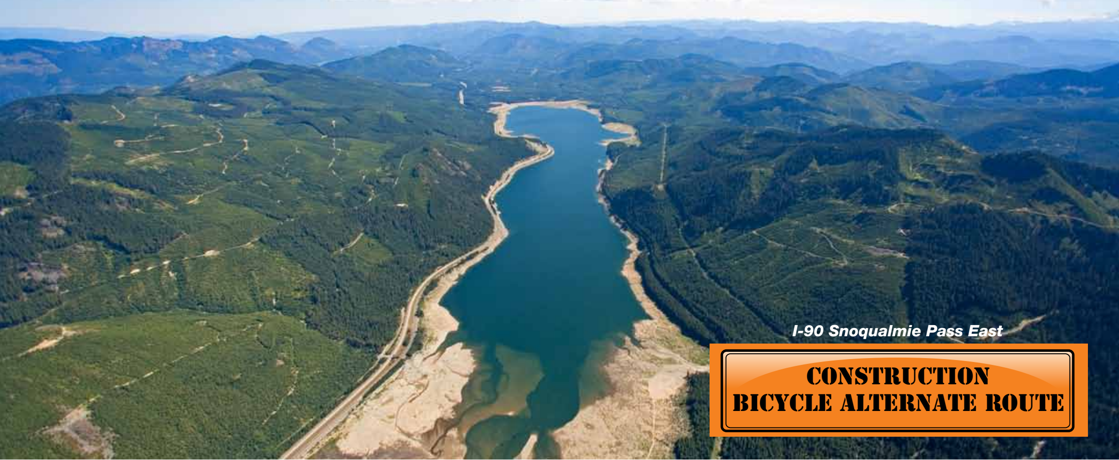
I-90 Snoqualmie Pass East

Because of these conditions, WSDOT is temporarily closing the project area to bicyclists for safety reasons. This decision was made in collaboration with the Cascade Bicycle Club, Bicycle Alliance of Washington, Redmond Cycling Club, organizers of the Courage Classic, and WSDOT traffic and bicycle mobility authorities. WSDOT is also working with these groups to allow major bicycle events to occur on I-90 by shuttling or transporting event bicyclists through the project construction zone. We appreciate your patience and understanding while WSDOT works to make I-90 east of Snoqualmie Pass a safer, more reliable transportation corridor.