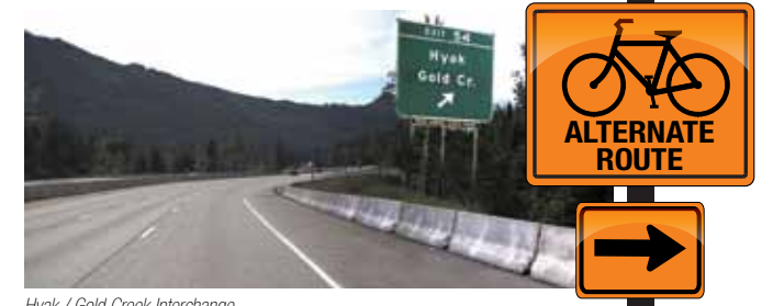
Hyak / Gold Creek Interchange

Eastbound bicyclists are required to leave I-90 at Exit 54 - Hyak / Gold Creek Road near milepost 55. The John Wayne Pioneer Trail parallels Keechelus Lake eastbound to the Stampede Pass area where bicyclists can follow the USFS 5400 road back to I-90 at milepost 62. Take a right to the on-ramp to merge onto I-90.