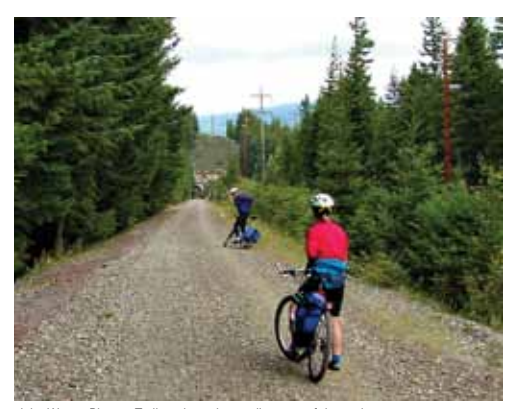
John Wayne Pioneer Trail at about three miles east of the project area.

The John Wayne Pioneer Trail will take the average cyclist roughly an hour to travel before merging back onto Interstate 90. Since the trail is a remote area away from the interstate, please use caution and be prepared.