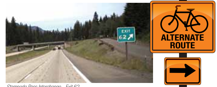
Stampede Pass Interchange - Exit 62

Westbound bicyclists are required to leave Interstate 90 at Exit 62 - Stampede Pass near milepost 62. The John Wayne Pioneer Trail parallels Keechelus Lake to Hyak and the interchange at milepost 55. Take a right under Interstate 90, then take a right to the on-ramp north to merge onto Interstate 90.